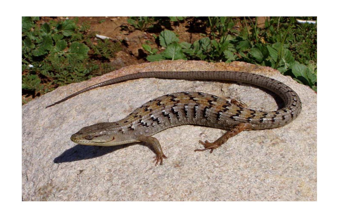
The lizard is on the rock.